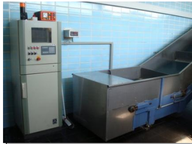
Step conveyor With integrated Weighing system