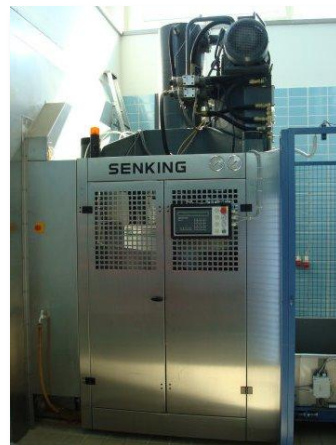
Press: SEP 36