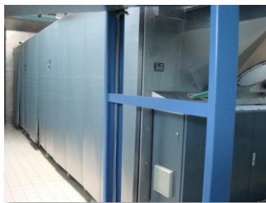
Senking 10 x 36kg