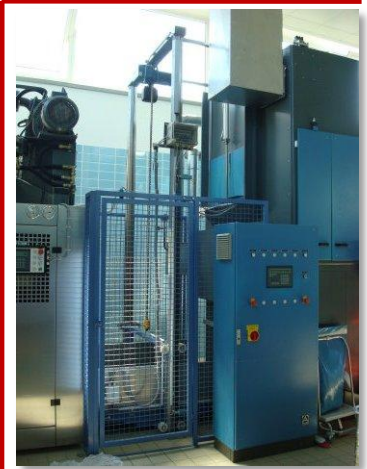
Dryer: Senking DTA 35, steam