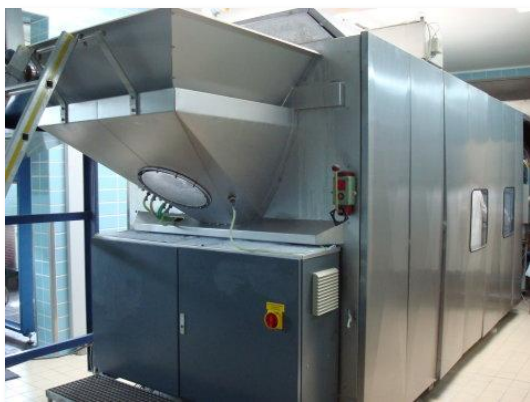
Tunnel: Senking P36-10